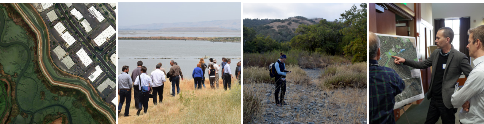
Left, imagery courtesy of Google Earth, other photos by SFEI.