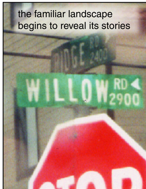
the familiar landscape begins to reveal its stories