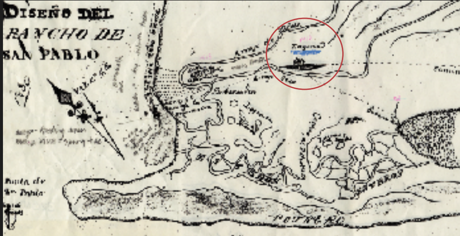
An 1830 sketch of the land now called Richmond