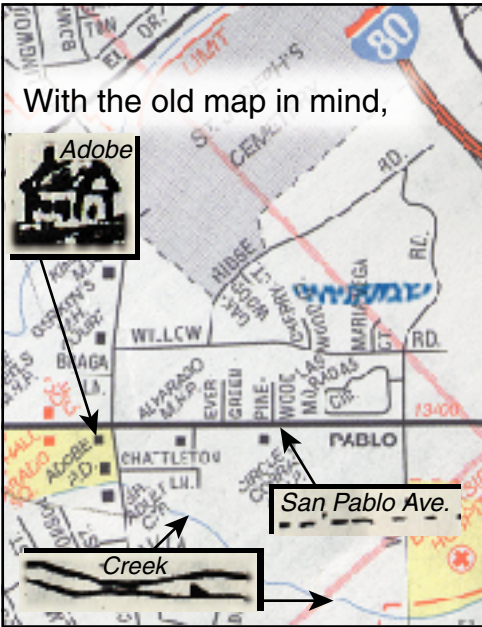
With the old map in mind,