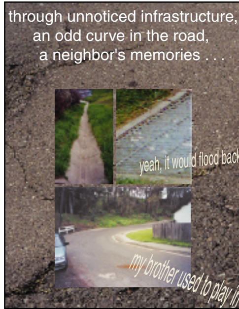
through unnoticed infrastructure, an odd curve in the road, a neighbor's memories . . .