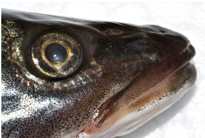
Sacramento Pikeminnow ( Ptychocheilus grandis ).

Fish tissue samples were analyzed for 13 polybrominated diphenyl ethers (PBDEs) and 13 perfluorinated alkyl substances (PFASs), including perfluorooctanesulfonic acid (PFOS). Seven of 13 PBDE congeners analyzed were detected in fish tissue. PBDE 47, a ubiquitous tetrabrominated congener, was detected in all 13 samples. PFOS was also detected in all 13 samples. Three additional PFASs were detected: perfluorodecanoate (in 7 samples), and perfluoroundecanoate and perfluorododecanoate (both in 4 samples).