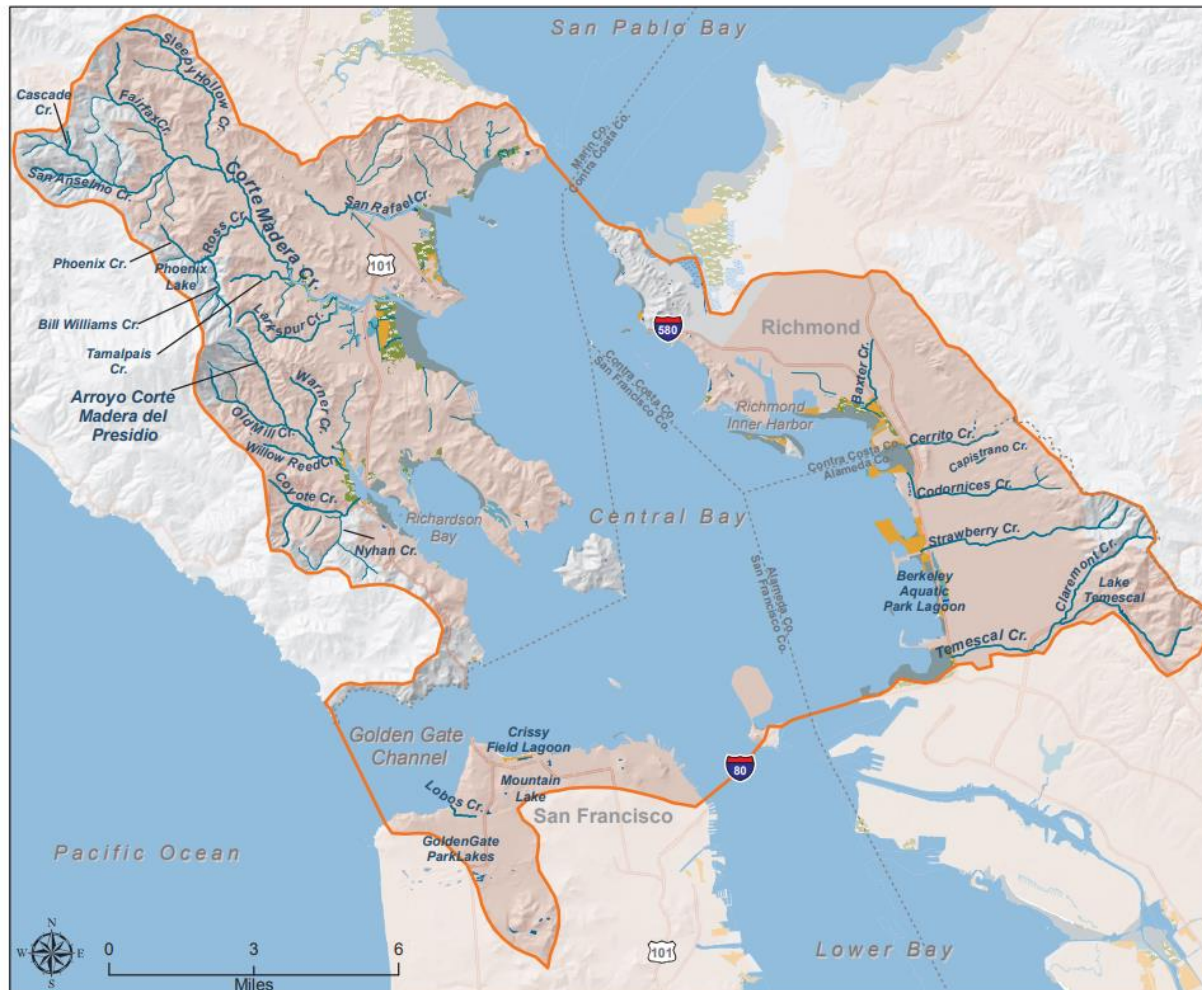
Figure 2-5 Central Basin