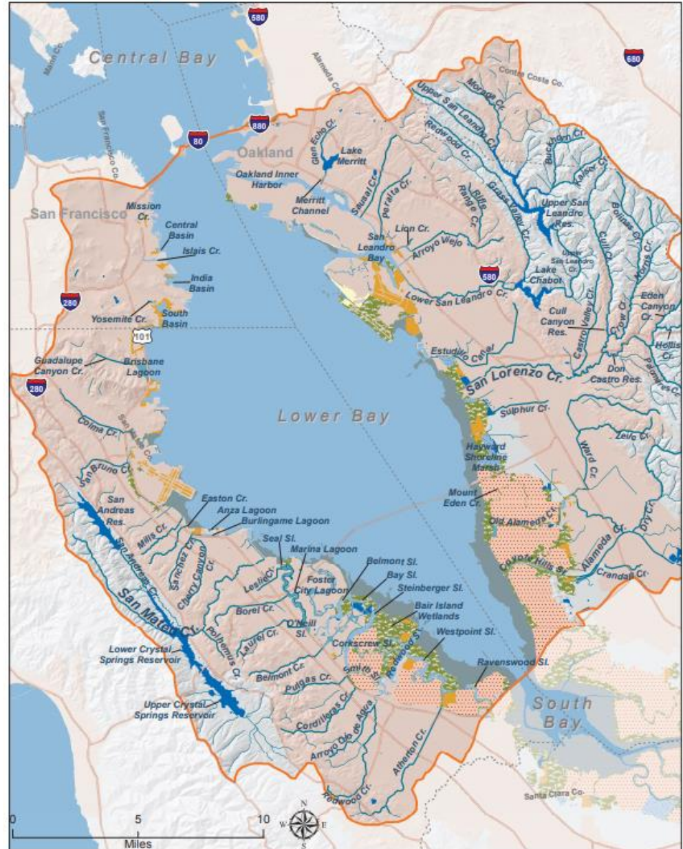
Figure 2-6a South Bay Basin